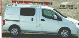
2018 NV200 ® COMPACT CARGO