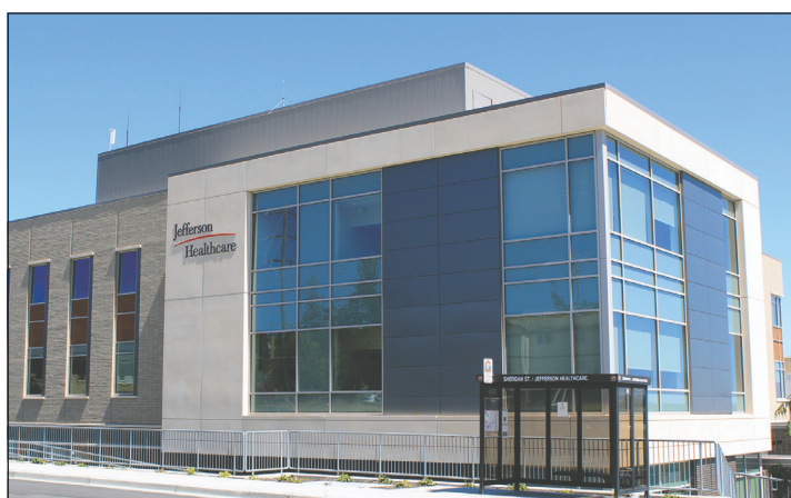
Jefferson Healthcare as viewed from Sheridan Street in Port Townsend.

Member Guest Column courtesy of Jefferson Healthcare