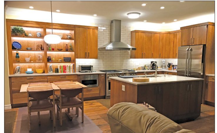
Contractor RH Mittet specializes in remodeling and tenant improvements for residential and commercial buildings, with recent projects including this complete kitchen remodel.