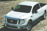
2018 TITAN ® XD ®